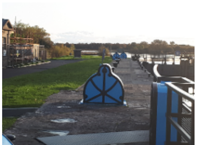
Here is a picture of the Victoria Lock.