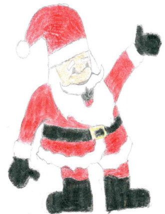
Illustration by Karl Lyons